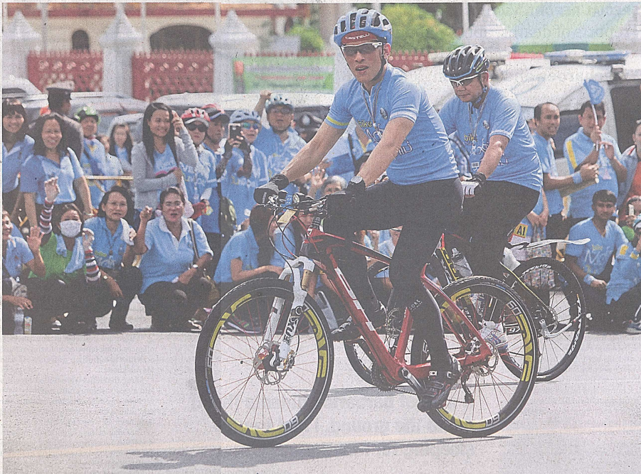
His Royal Highness Crown Prince Maha Vajiralongkorn leads the mass biking event, followed closely behind by Prime Minister Gen Prayut Chan-o-cha. More than 294,800 people from all walks of life joined the Bike for Mom campaign nationwide.

It was an historical day, cyclists and curious onlookers agreed cheerfully,