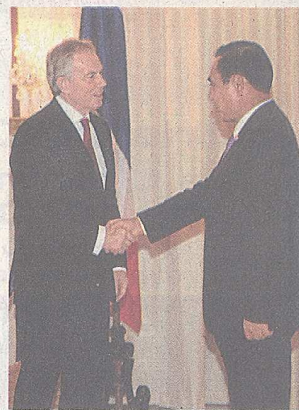
Former British prime minister Tony Blair shakes hands with Prime Minister Prayut Chan-o-cha during a courtesy call at Government House yesterday.

it would be advisable for the Thai government to explain to foreign countries as quickly as possible what the political and economic situation is like in Thailand at present.