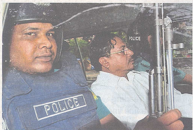
Bangladeshi Jamaat-e-Islami leader, Mohammad Kamaruzzaman, right, sits next to a police officer as he leaves court in Dhaka in May last year.

Police are investigating if they were gang-raped before being lynched.