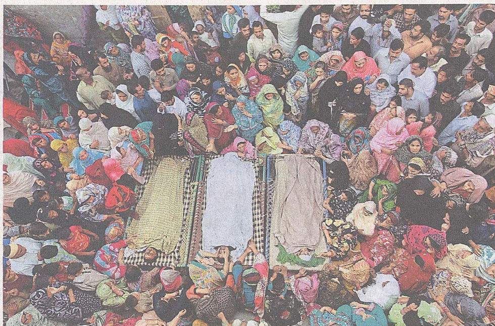
Relatives gather beside the bodies of victims killed in Sunday's suicide bomb attack at the Wagah border crossing, before funeral prayers in Lahore yesterday. At least 60 people died in the attack on the Pakistani-Indian border.

"The crossing will remain closed till we complete a combing